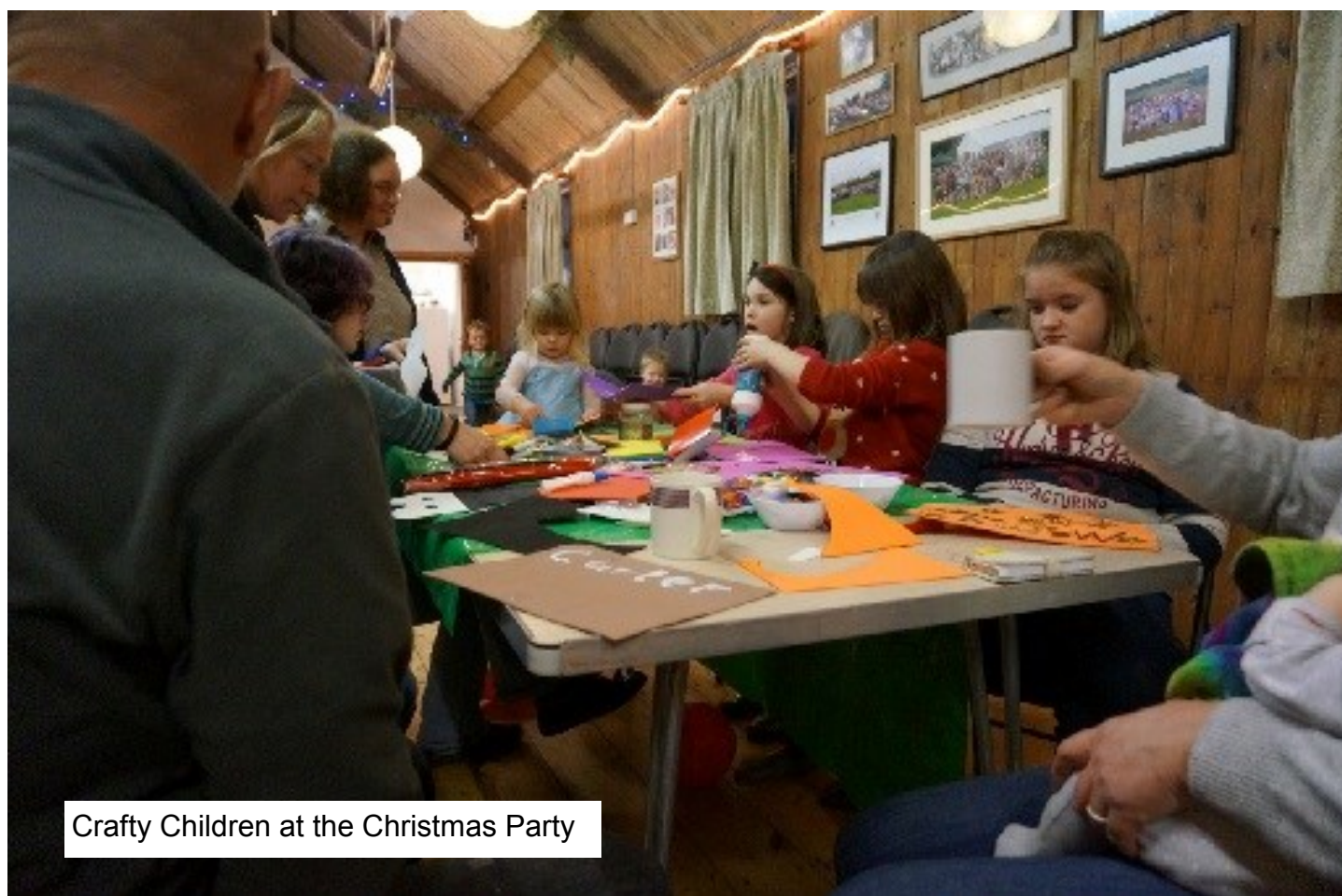
Crafty Children at the Christmas Party