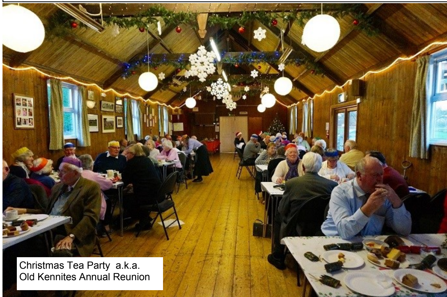
Christmas Tea Party a.k.a. Old Kennites Annual Reunion