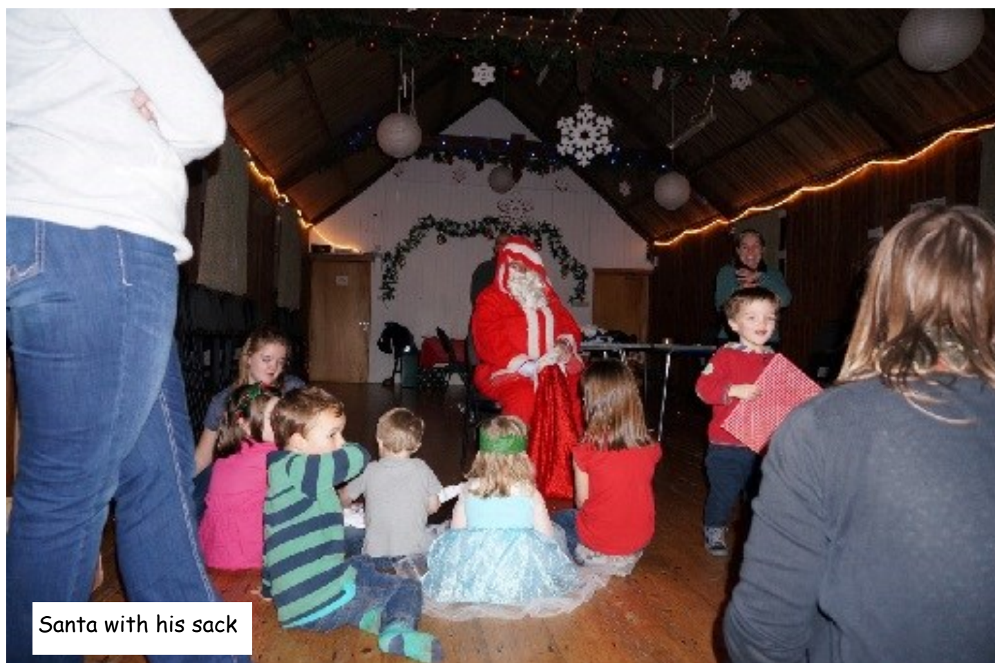
Santa with his sack