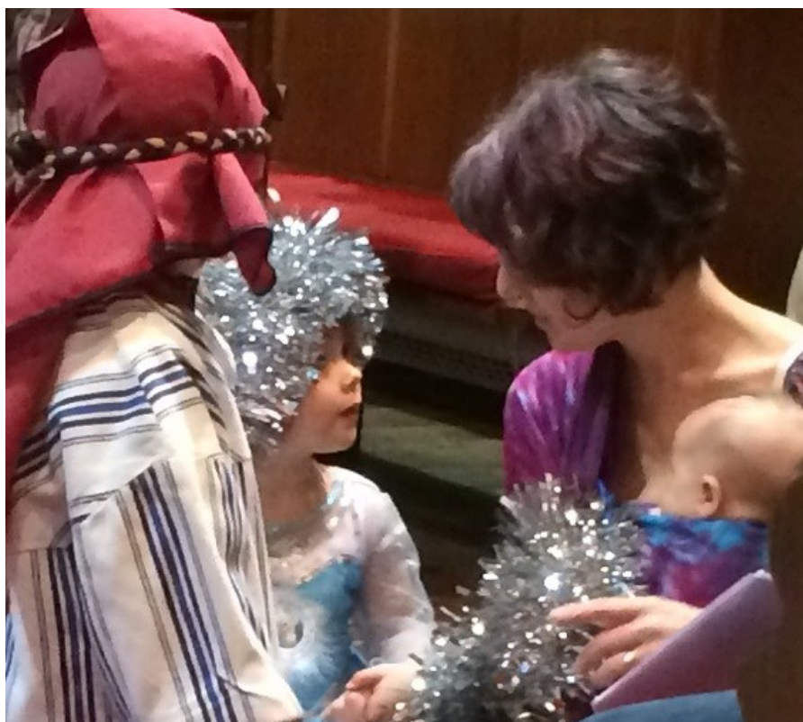
Some snaps from the Crib Service At St. John's on Christmas Eve